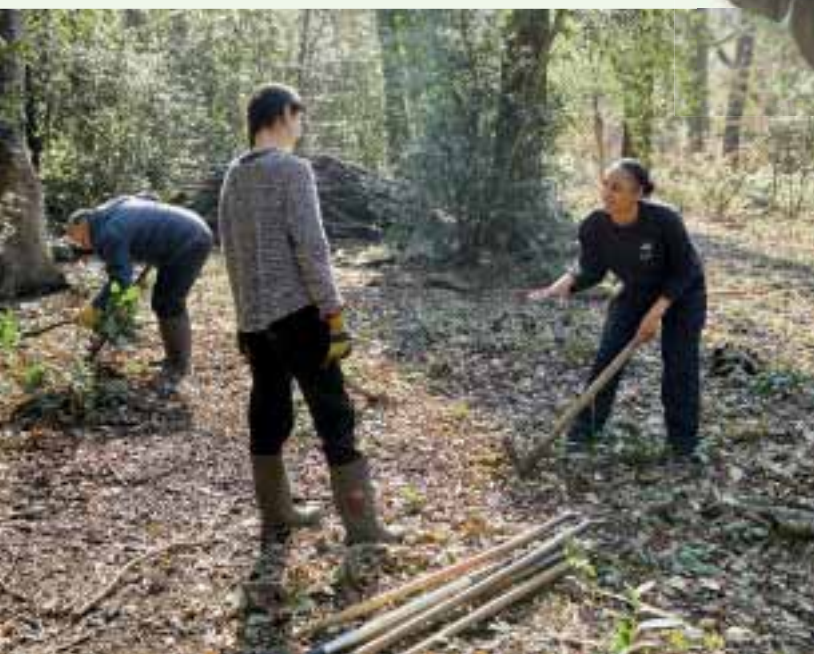
PRACTICAL CONSERVATION IN A WOODLAND ABOVE: SMALL BLUE BUTTERFLY